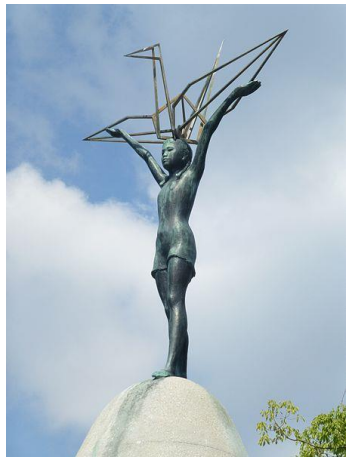
Statue of Sadako - Hiroshima Peace Parl