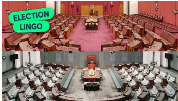
BTN Election Lingo – Houses

As a class, watch BTN's Houses explainer to learn more about houses in Australian Parliament. Discuss the BTN story as a class and record the main points of the discussion. Students will then respond to the following discussion questions.