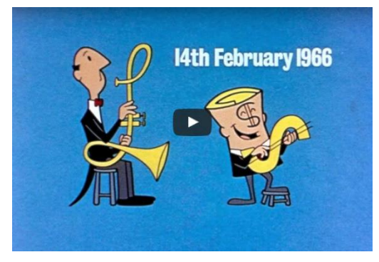
<u>Dollar Bill and Australians Keep the Wheels</u> of Industry Turning,

This animated television advertisement was designed to assist Australians with the change from imperial to decimal currency on 14 February 1966. After being shown on television night after night from April 1965 until the beginning of change-over in February 1966, the catchy song was well known by Australians. In September 1965 the Decimal Currency Board reported receiving 500 fan letters from children for Dollar Bill.