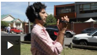
Recording great audio