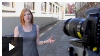
Shooting the story