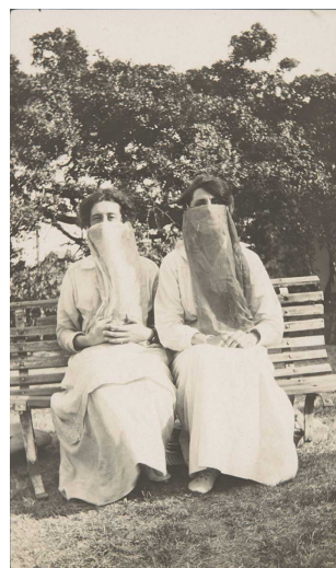
National Museum Australia