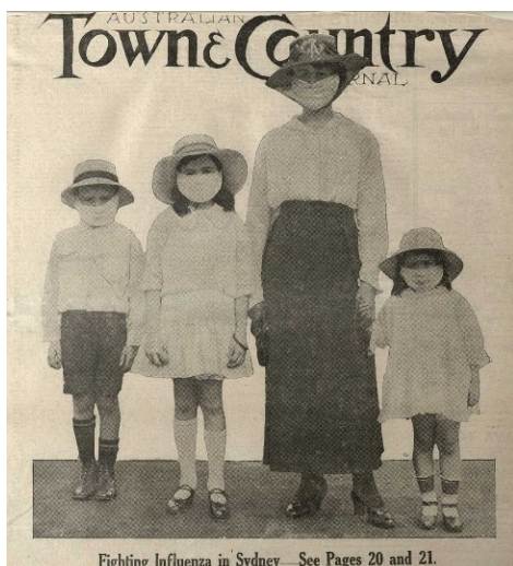
National Museum Australia