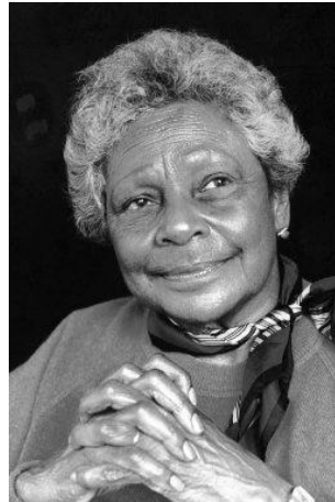
Faith Bandler, source of image

Use the questions below to get a class discussion started with your students about biographical writing.