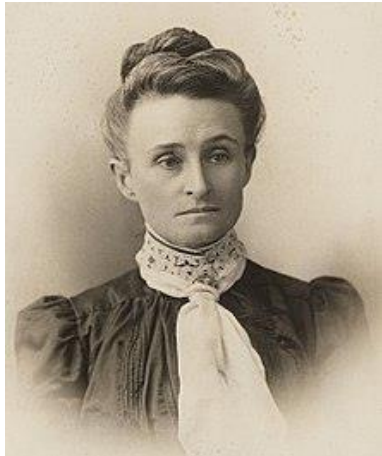
Edith Cowan, Source of image

Students will choose a well-known Australian woman to research and write a biography about. They can choose one of the women featured in the BTN Women's History Month stories (see images below) or another significant Australian woman else. Before students begin to construct their biographies, hold a class discussion to find out what they already know about biographical writing.